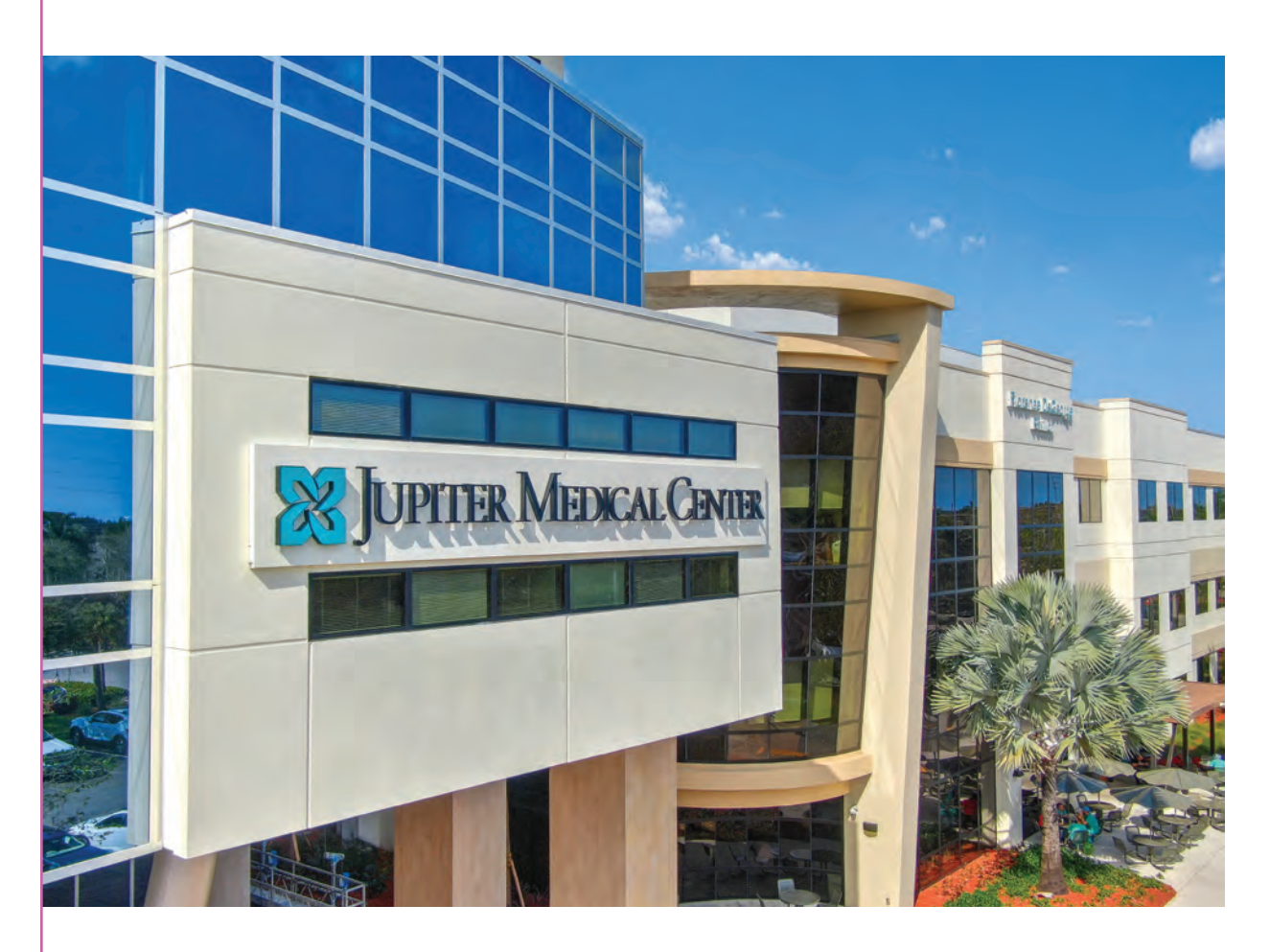
Code of Ethical Conduct